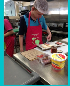
Aspley Special School Tuckshop