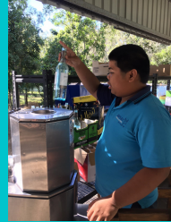
Kingfisher Recycling Centre