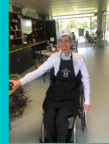
Frothee Coffee Shoppee

The PATH process helps teachers, students and parents to decide what senior school pathway best suits the individual student needs. The following programs are delivered at Aspley Special School.