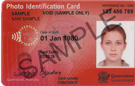
Photo identification card